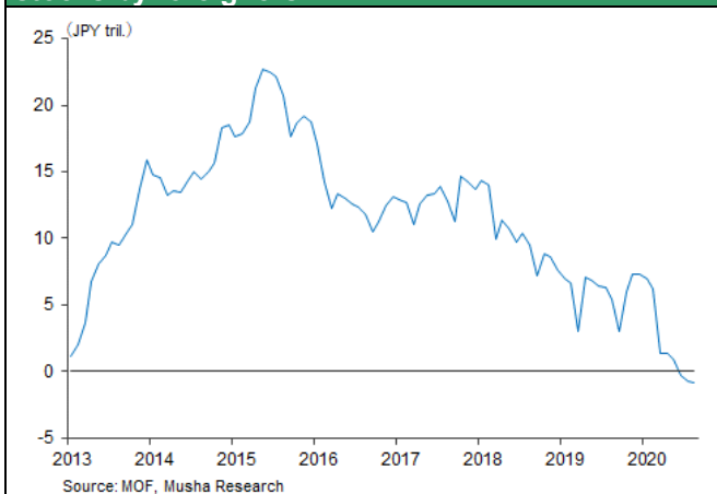
Figure 3: Accumulated net purchase of Japanese stocks by foreigners

Contrary to such political development in Japan, global investors have thoroughly sold Japanese stocks. Foreign investors bought over 23 trillion yen of Japanese stocks between December 2012, when Mr. Abe won the election, and the end of June 2015. However, since then, it has continued to sell Japanese stocks, and as of August 31, it has sold everything it bought, and the cumulative total since the inauguration of the Abe administration has reached 868.8 billion yen of negatives. (Figure 3).